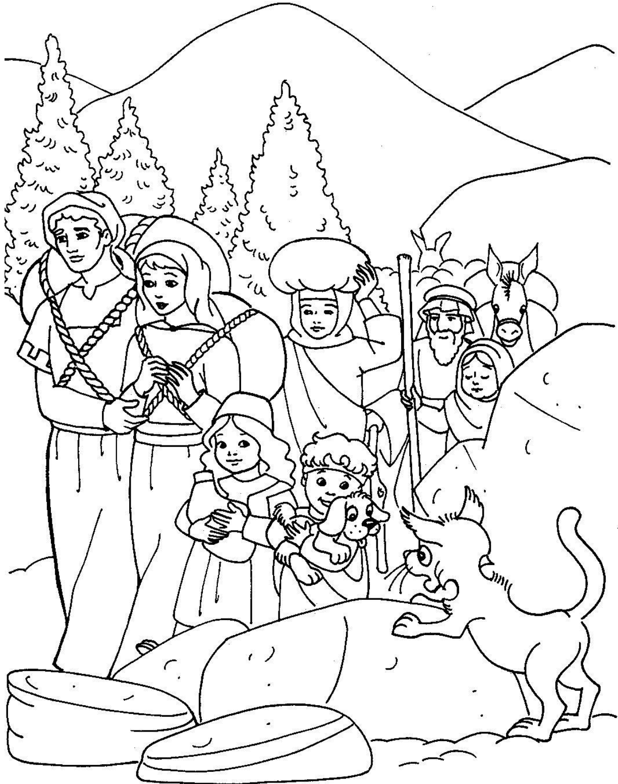
The Israelites hurry out of Egypt towards the Red Sea